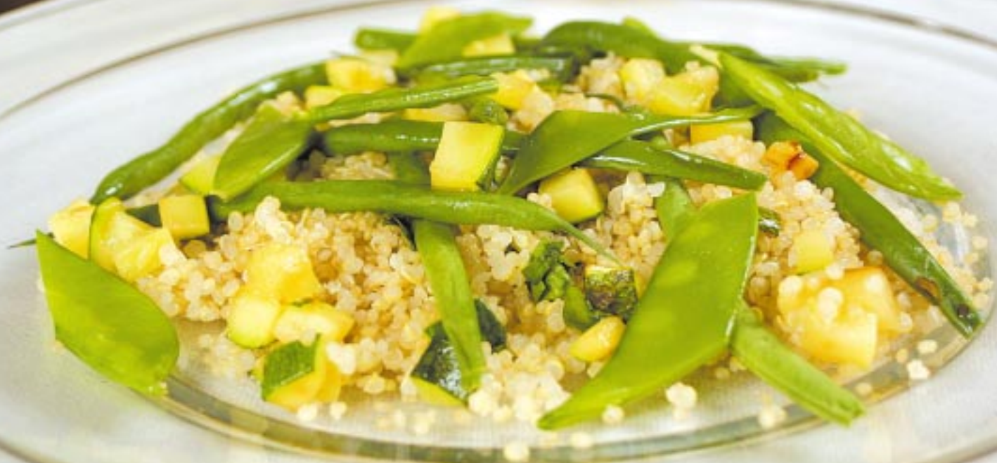
String beans and peas, which are kitniyot, are used by Sephardim on Pesach.