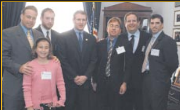
Mission delegates from Boca Raton, Florida, meet with Robert Wexler (D-FL).