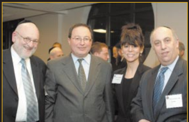
The day's closing reception featured Rafi Barak, Israel's deputy ambassador to the United States.