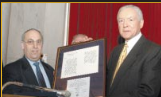
Presenting the Friend of Religious Liberty Award to Senator Orrin Hatch (R-UT).