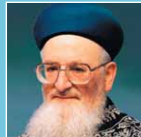
Rabbi Mordechai Eliyahu Former Sephardic Chief Rabbi of Israel

They all agree that brain-stem death is halachic death even though the heart is still beating – and support organ donation!