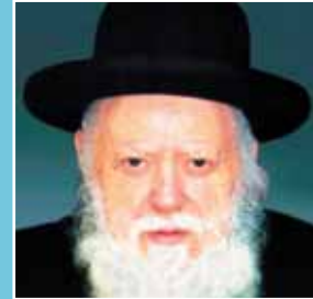
Rabbi Avraham Shapira z"l Former Ashkenazi Chief Rabbi of Israel