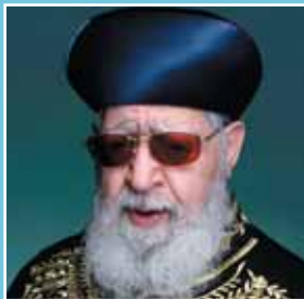
Rabbi Ovadya Yosef Former Sephardic Chief Rabbi of Israel