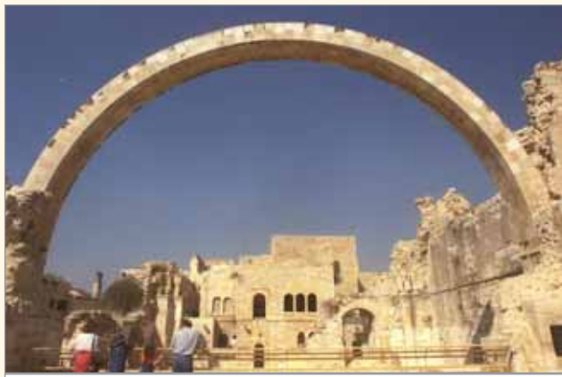
The Hurva Synagogue in the Jewish Quarter of the Old City of Jerusalem, 1995. The building has been built, destroyed and rebuilt several times. It is currently undergoing construction.

tore down the incomplete structure. The remnants remained for some time, giving the synagogue its name, “Hurva,” which means “ruins” in Hebrew. The talmidei haGra rebuilt the synagogue, designed in a grand Neo-Byzantine style, in 1864, and for the next eighty-four years it was one of the largest buildings in the Old City. In 1948, during Israel’s War of Independence, the Jordanian army destroyed the Hurva as part of an effort to eradicate the Jewish presence in the Old City. Since the Israeli capture of Jerusalem in 1967, the Hurva has been under Israeli control. For decades, little remained of the synagogue except for a slender arch, erected in 1977. In 2006, the Israeli government began work on a multi-million dollar project to construct an exact replica of the Hurva. - Ed.