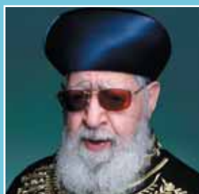
Rabbi Ovadya Yosef Former Sephardic Chief Rabbi of Israel