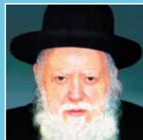
Rabbi Avraham Shapira z"l Former Ashkenazi Chief Rabbi of Israel