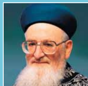
Rabbi Mordechai Eliyahu Former Sephardic Chief Rabbi of Israel

They all agree that brain-stem death is halachic death even though the heart is still beating – and support organ donation!