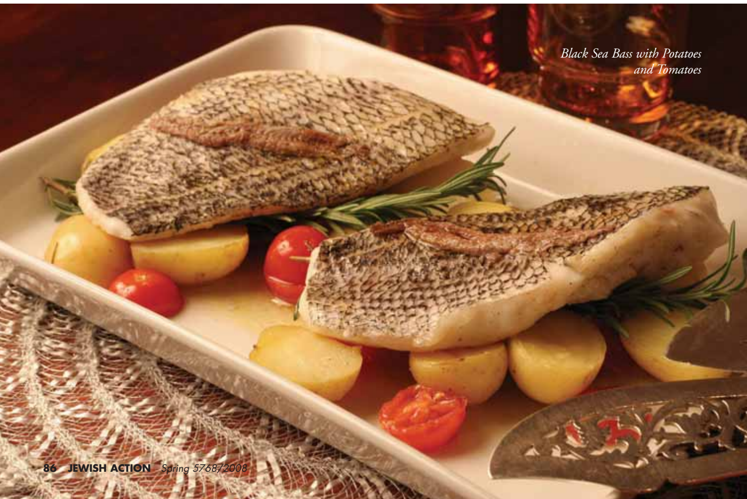
Black Sea Bass with Potatoes and Tomatoes