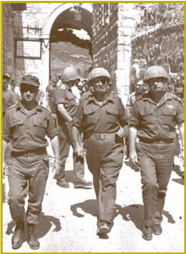
Jerusalem Commander Uzi Narkism, Defense Minister Moshe Dayan and IDF Chief of Staff Yitzchak Rabin enter the Old City of Jerusalem through the Lion’s Gate on June 7, 1967.

Can anyone not see the finger of God in all that has befallen us? ... It has been now six years that towns and villages and wells and flocks have arisen from the dust; the fields are full of grain, and grapes and vines cover the hills. Fourteen colonies have been founded during this period, and 3,000 of our brothers are working there. Before, the holy ways were filled with thorns and