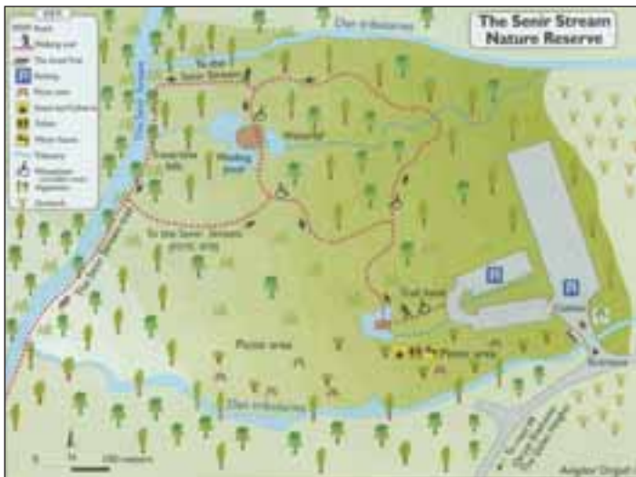
The Hatzbani Nature Reserve accommodates hikers of all abilities and even offers wheelchair trails.

Hatzbani River, and this hike is well worth the effort, even if you only go to peek at the stream and then turn around.