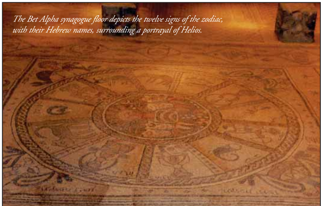
The Bet Alpha synagogue floor depicts the twelve signs of the zodiac, with their Hebrew names, surrounding a portrayal of Helios.

The large number of ancient synagogues in the Galil testifies to the extent of Jewish life that continued to thrive in the land of Israel until the seventh century. IA